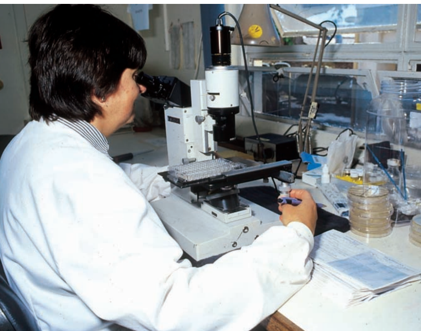
Use of an inverted microscope in the routine microbiology lab to examine urine samples

Automated analysis of the size of urinary red cells may also suggest where they came from (because red cells which have passed through the